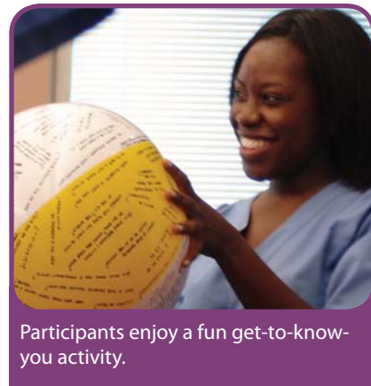
Participants enjoy a fun get-to-know-you activity.