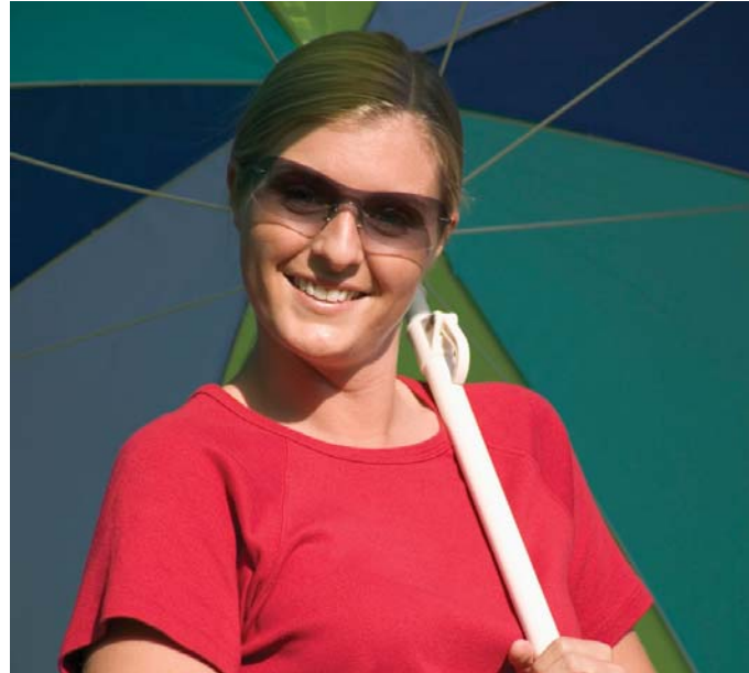
The literature states that 1 billion people worldwide have a vitamin D deficiency or insufficiency.