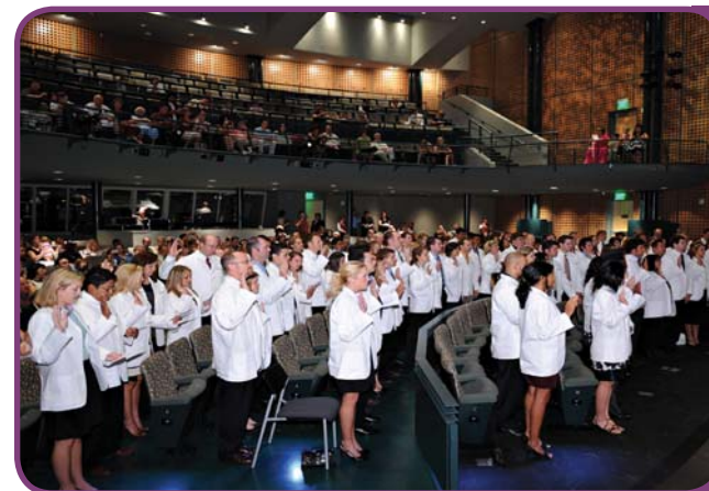
The class of 2012 takes the Osteopathic Pledge of Commitment at SOMA's white coat ceremony held at the Mesa Arts Center.