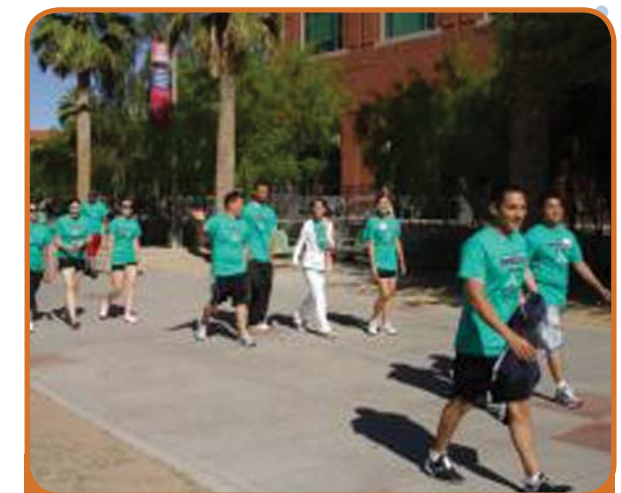
The "Hepatitis Will Unite Us" walk raised $1,000 for the Asian Liver Center at Stanford University.

Her concern led her to organize the "Hepatitis Will Unite Us" walk at UA in April. It was one of a few walks in the nation dedicated to raising funds for liver cancer research and bringing attention to hepatitis in the Asian American community. The walk raised $1,000 for the Asian Liver Center at Stanford University.