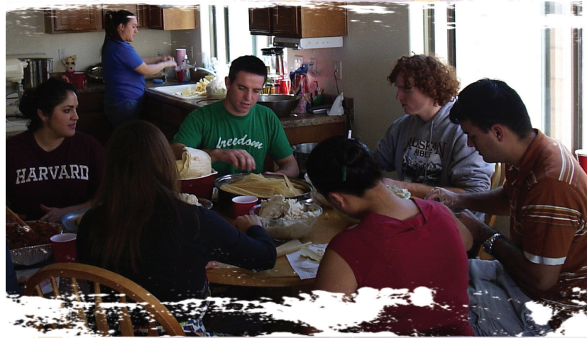
HSDA students and faculty made more than 600 tamales for the fundraiser.

The Hispanic Student Dental Association at ASDOH held its first annual tamale fundraiser in December, raising funds for upcoming projects and community events. After more than a month of planning, HSDA student and faculty members gathered together for a weekend-long tamale-making fest where more than 600 tamales were made. Nearly $600 was raised to improve the oral health of Hispanics throughout Arizona. HSDA thanks all who supported the sale and helped make it a success. HSDA welcomes and encourages all ASDOH students to be involved with the association, regardless of background. Many more fundraisers and community events are planned as the group prepares for the 2008 Annual Hispanic Dental Association Conference in Carefree, Ariz., in November.