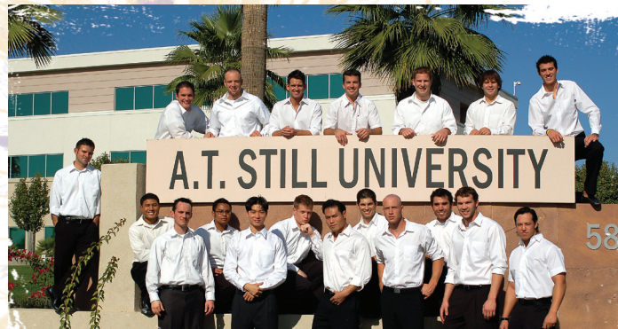
The 2008 Men of ATSU calendar cover.

Twenty-one men from the Arizona Campus put their best faces forward as models for the 2008 Men of ATSU calendar. The calendar fundraiser was organized by ASDOH's Class of 2010. Each month's spread was shot on the Arizona Campus and includes students from ASDOH, SOMA, and ASHS.