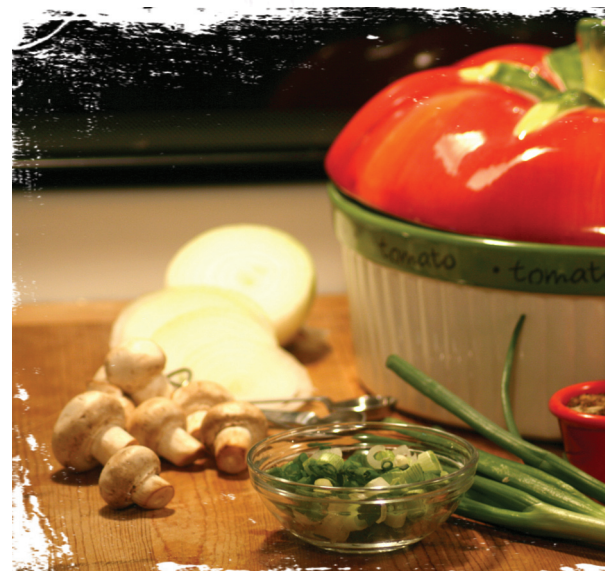
Proceeds from the cookbook benefit The Melonhead Foundation.

The Kettel Society will continue to sell cookbooks throughout the year. To support the Kettel Society and The Melonhead Foundation, make a purchase by emailing kettel@atsu.edu .