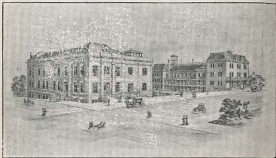
THE AMERICAN SCHOOL OF OSTEOPATHY AND A. S. O. HOSPITAL, KIRKSVILLE, MO