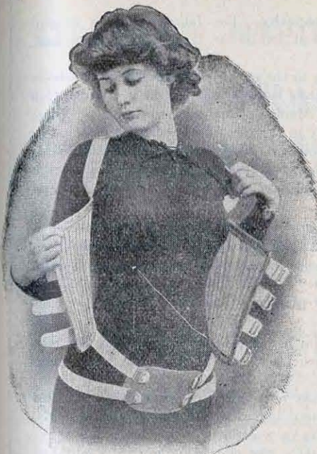
Front View Appliance No. 1.