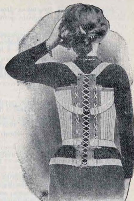
Back View Appliance No. 2.

Every Osteopath knows how important it is to keep the spinal column in perfect adjustment after each treatment.