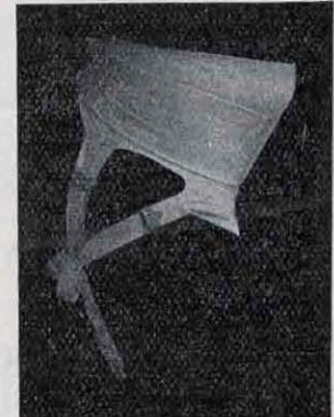
Woman's Belt—Side View

The Easiest Way to Restore Fallen Arches—Use the