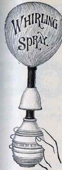
MARVEL "WHIRLING SPRAY" SYRINGE