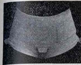
Woman's Belt—Front View

The "Storm" Binder may be used as a SPECIAL support in cases of prolapsed kidney, stomach, colon and hernia, especially ventral and umbilical variety. As a GENERAL support in pregnancy, obesity and general relaxation; as a POST-OPERATIVE Binder after operation upon the kidney, stomach, gall-bladder, appendix or pelvic organs, and after